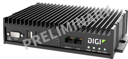
DIGI TX40 WITH SIM COVER