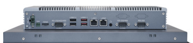
ASLAN II 18.5"