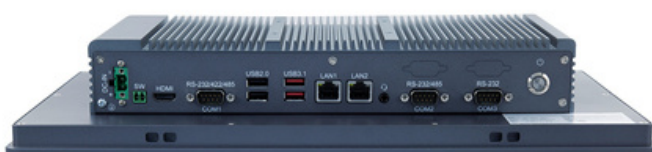
ASLAN II 15.6" & 21.5"